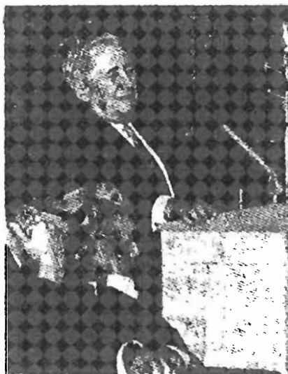
Dr. Nahum Goldmann, President of the World Zionist Organization and the Jewish Agency