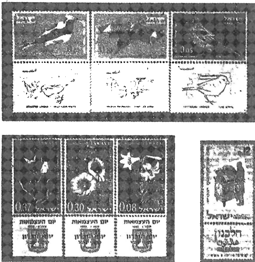
New stamps to be issued by the Ministry of Posts shortly include: Three additional items in the airmail series, showing birds of Israel, designed by Miriam Karoli, and printed by photo-gravure; Independence Day stamps, 1963, showing flowers of Israel, designed by Z. Narkiss, and printed by photolitho; commemorative issue: 100 Years of the Hebrew Press in the Land of Israel, designed by O. Wallisch, and printed by photogravure.

A NEW OIL strike made at Kochav 5, near Ashkelon in the South on March 22, is believed by the experts of the Lapidot Company to be Israel's most significant oil discovery to date, which may make the country self-sufficient in petroleum. The strike was made in a section of dolomite rock, the first time oil has been struck in Israel elsewhere than in a sand layer. The output, limited by a valve open only five millimeters, is 240 barrels per day, which is 100 barrels more than the best wells in the Kochav and nearby Heletz fields.