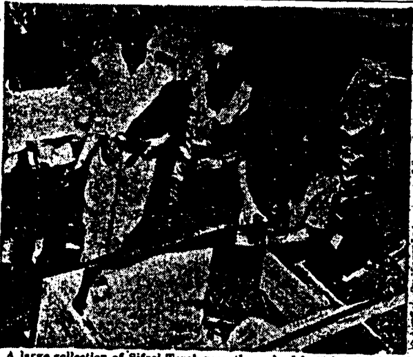
A large collection of Sifrei Torah recently arrived in Tel Aviv aboard the S.S. Mentor as the gift of Scandinavian Jewry to the people of Israel. A delegation of Israeli Army chaplains and Tel Aviv rabbis went aboard to carry them to the Holy Land. These Sifrei Torah were hidden during the Nazi occupation and thus avoided destruction. Here, the Sifrei Torah are removed from their cases on the ship.