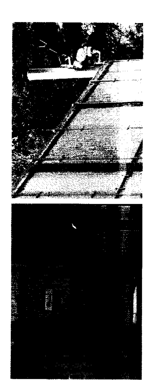
Solar Farm – Security Advisory